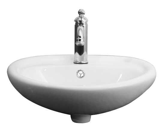
Faucet not included